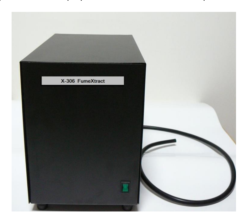
FIG 1. VIEW OF THE SYSTEM

The unit can be supplied from 208-240V and when used to extract fumes from a batch oven can be connected to the outlet provided for this purpose and located on the back panel of X-Reflow306 oven.